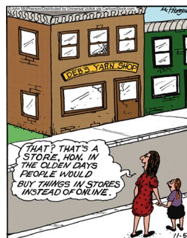
In the year 2030.