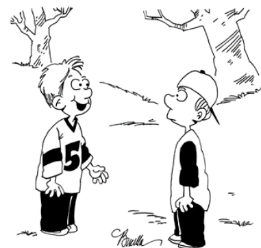
"You know what I just noticed about playing outside? No pop-up windows."